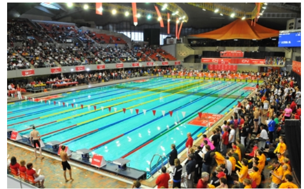
Olympic swimming selection preceding the 2008 Beijing Games.

The Sports Centre's permanent stands, which include 2,777 seats, are used to accommodate spectators at these events.