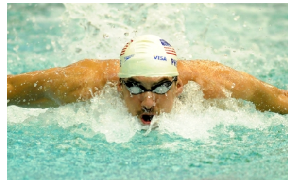
Michael Phelps at the 2009 Québec Cup swimming competition.