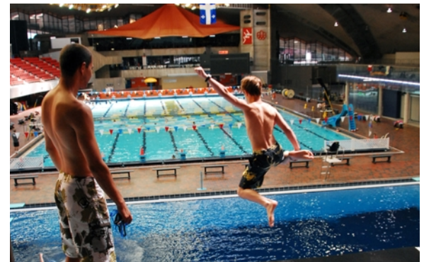
People of all ages enjoy the installations.